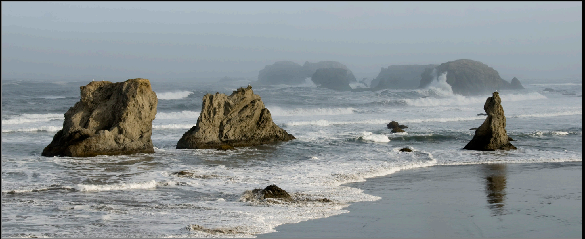
Bandon Stacks Morning 2