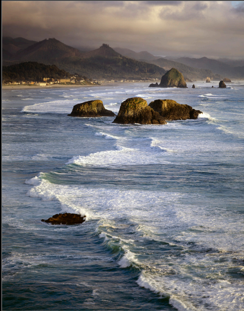
Haystacks & Waves Cannon Beach