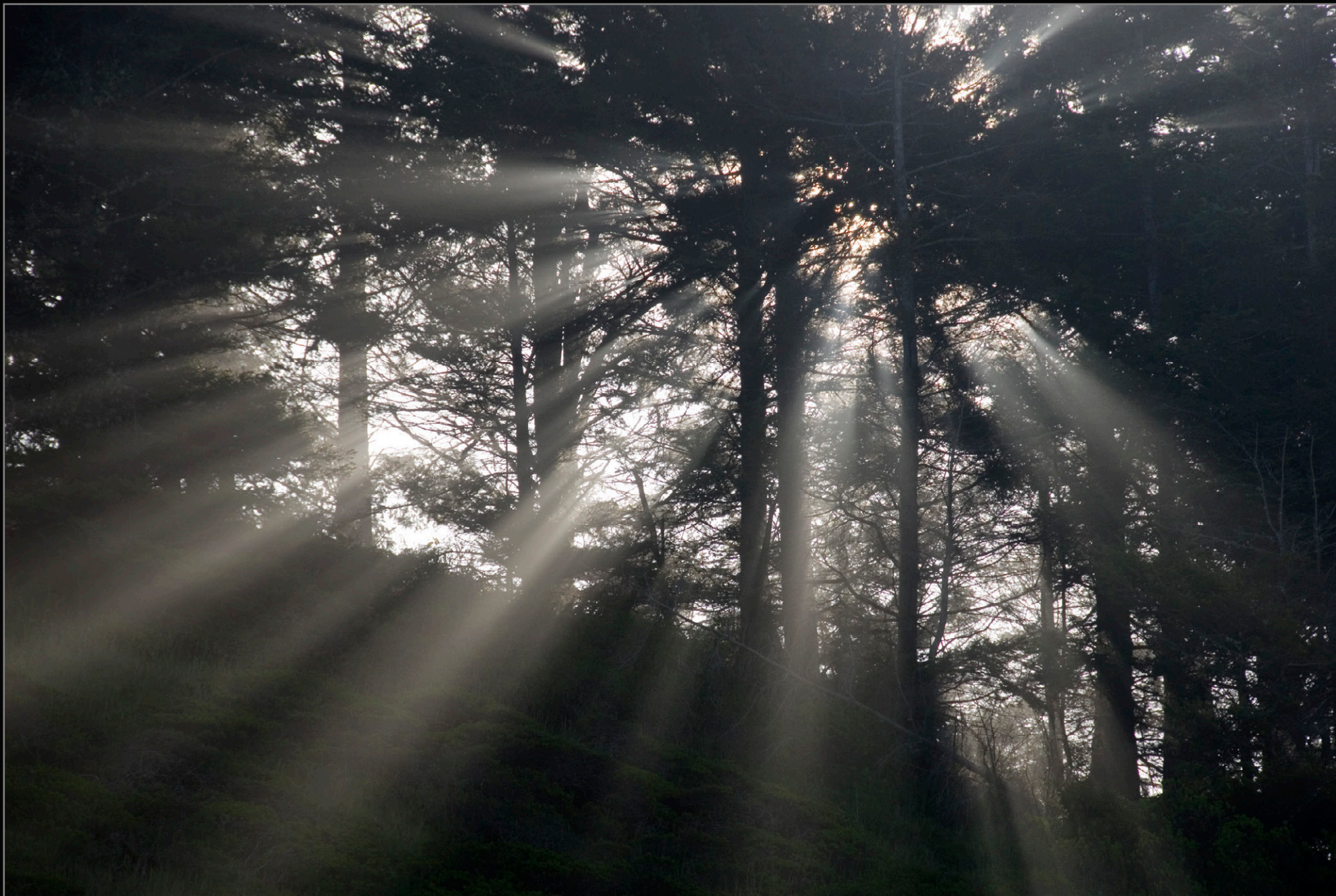
Oregon Coast God Rays 1