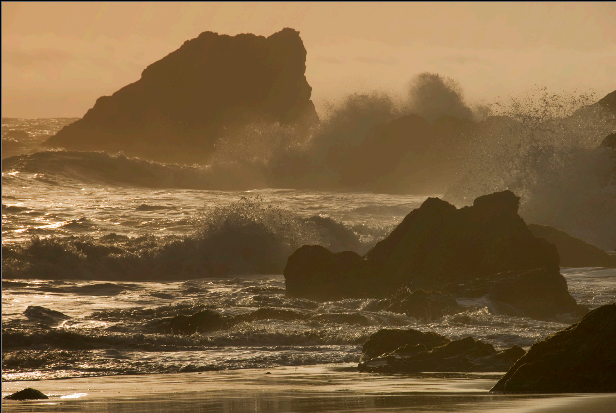
Harris Beach Sunset Stacks 3