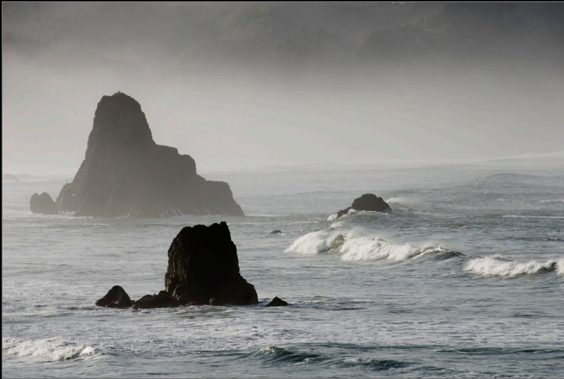
Port Orford Stacks