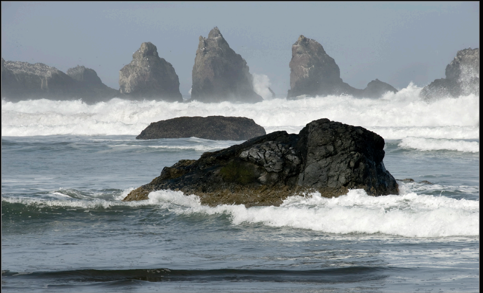
Bandon Sea Stacks 3