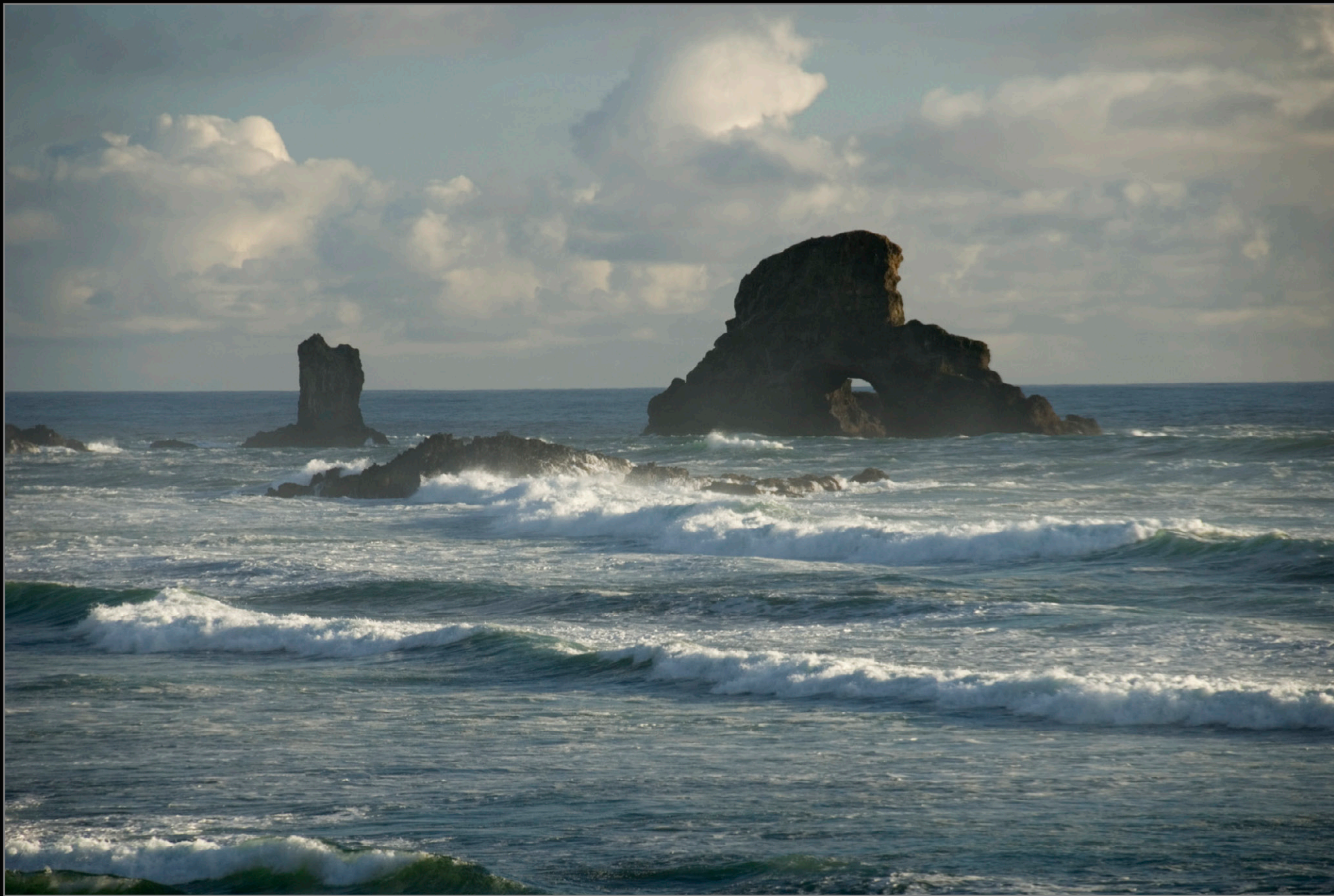
Ecola SP Rocks & Waves