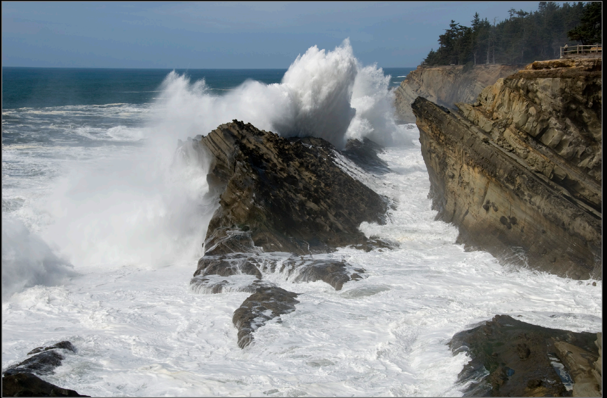
Shore Acres 3