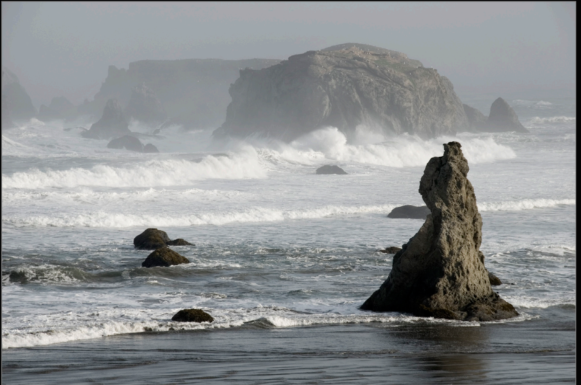
Bandon Stacks Morning 1