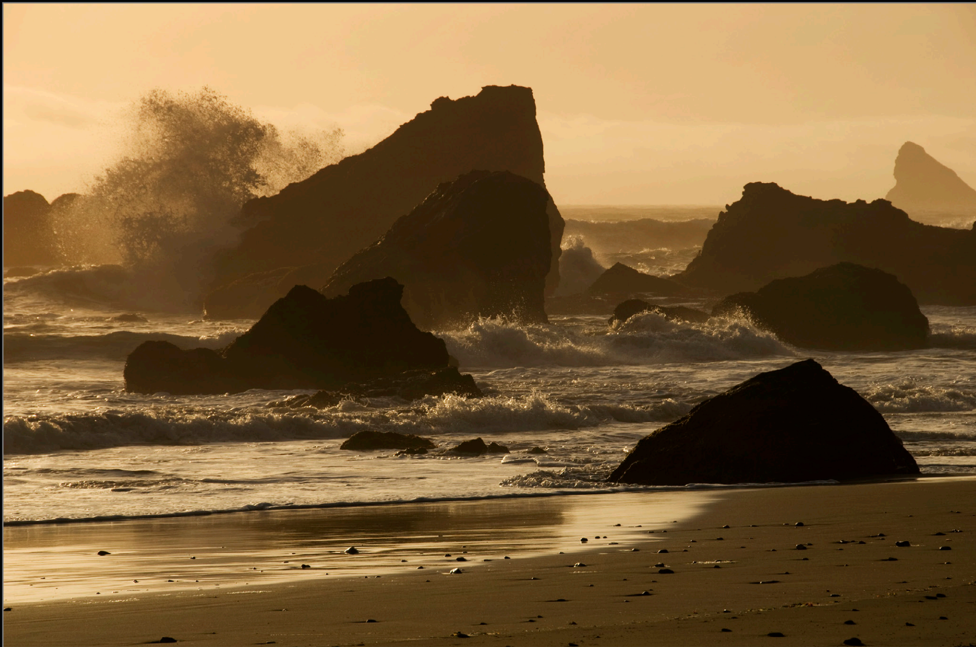
Harris Beach Sunset Stacks 4