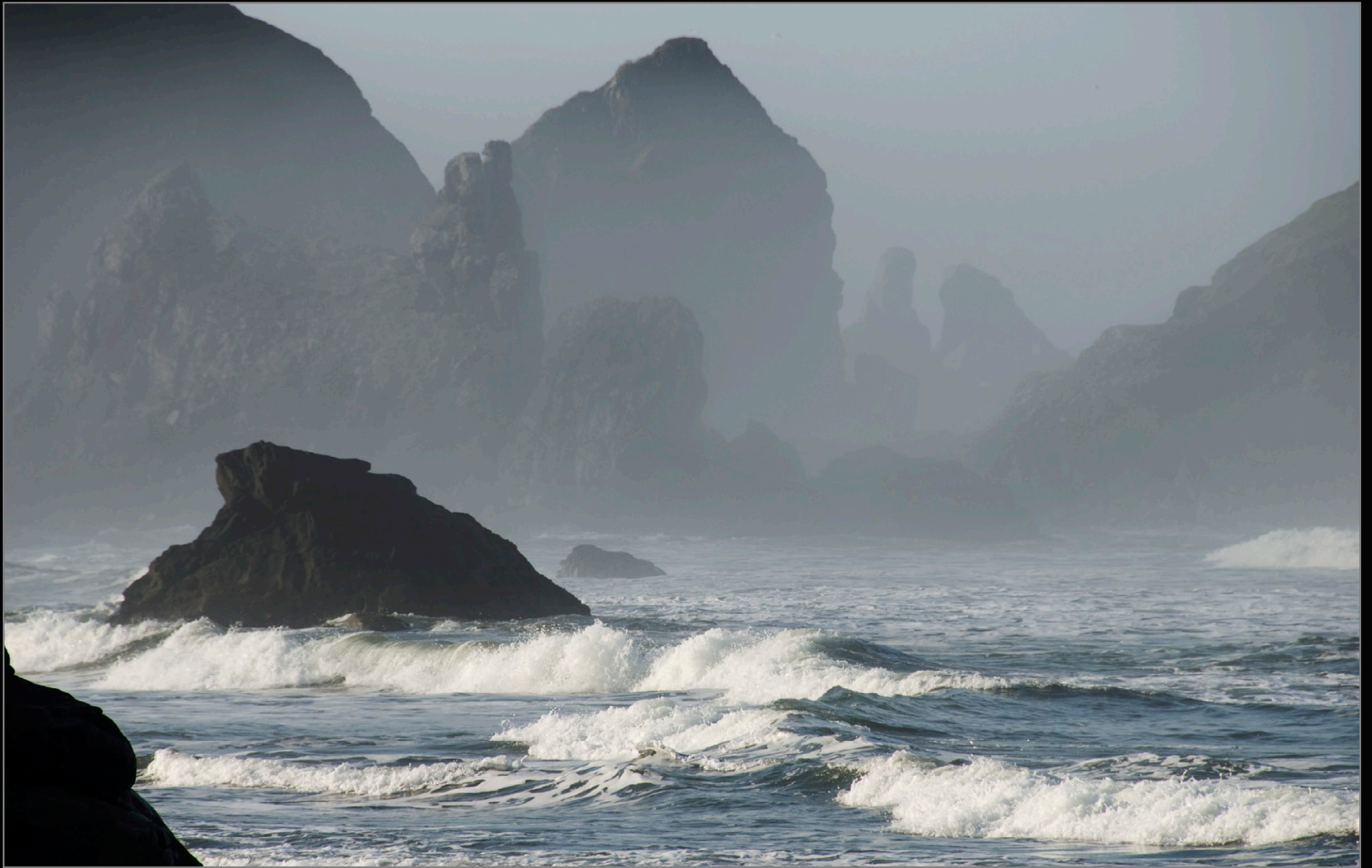
Lone Ranch Rocks & Surf 2