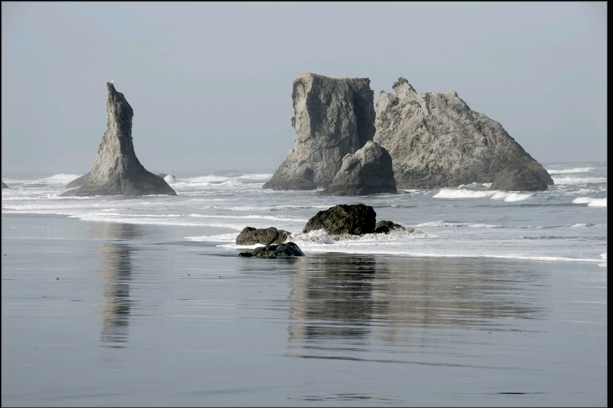
Bandon Sea Stacks I