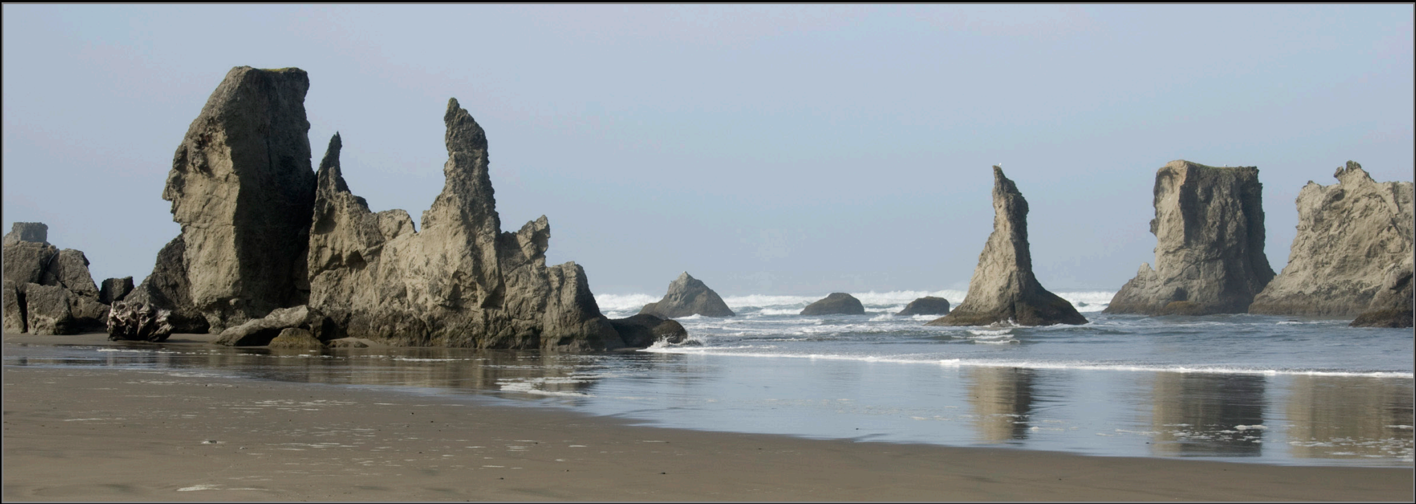
Bandon Sea Stacks 4