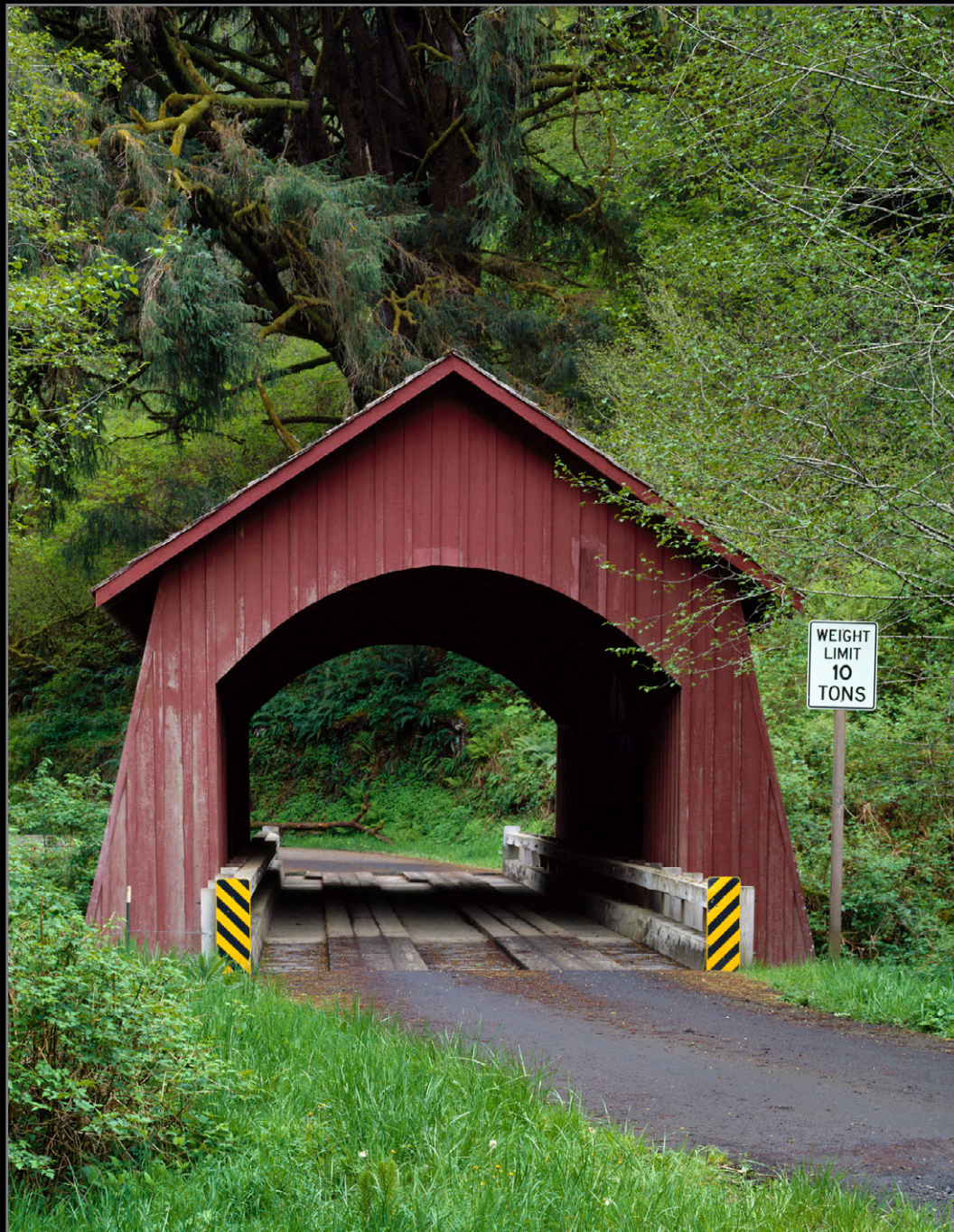
Yachats Covered Bridge