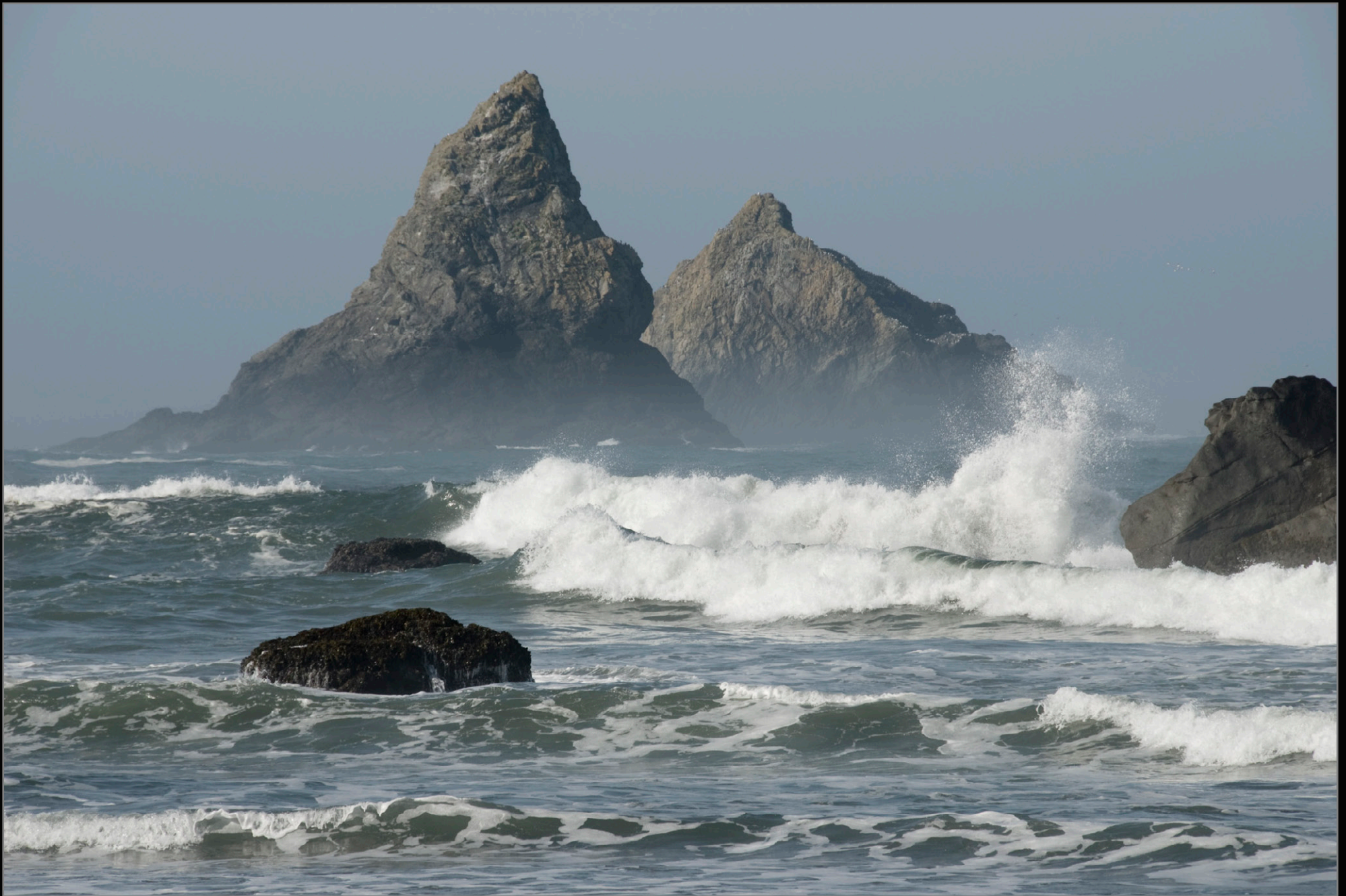
Lone Ranch Rocks & Surf 1