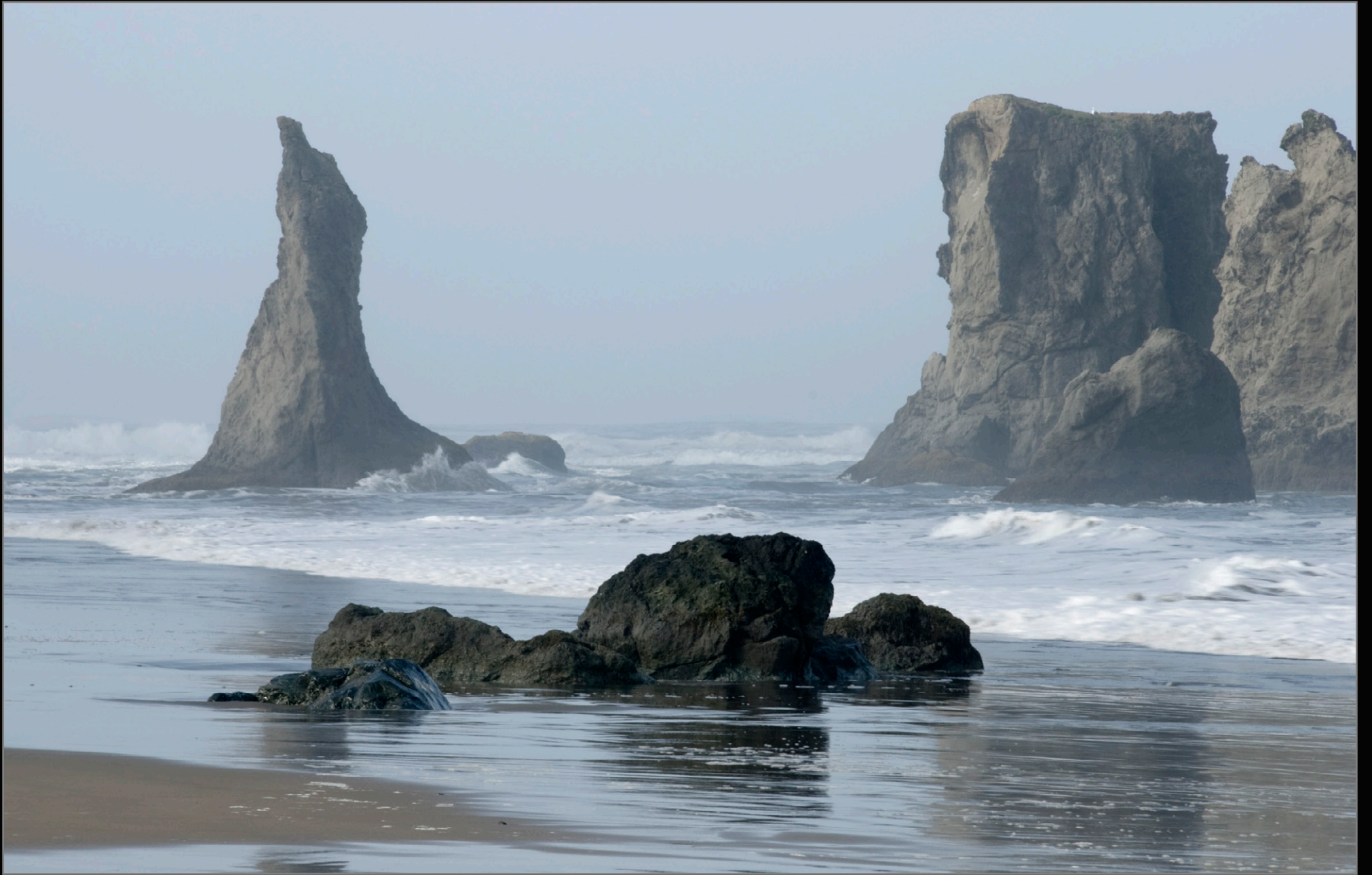
Bandon Sea Stacks 2