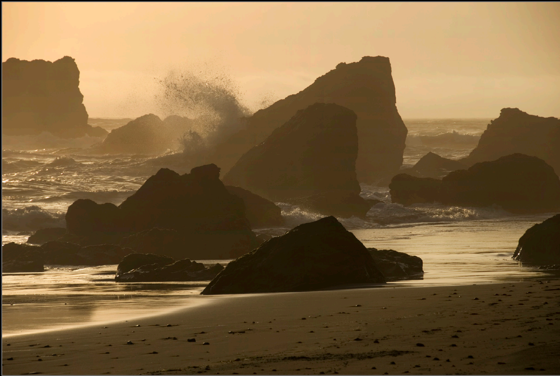
Harris Beach Sunset Stacks 2