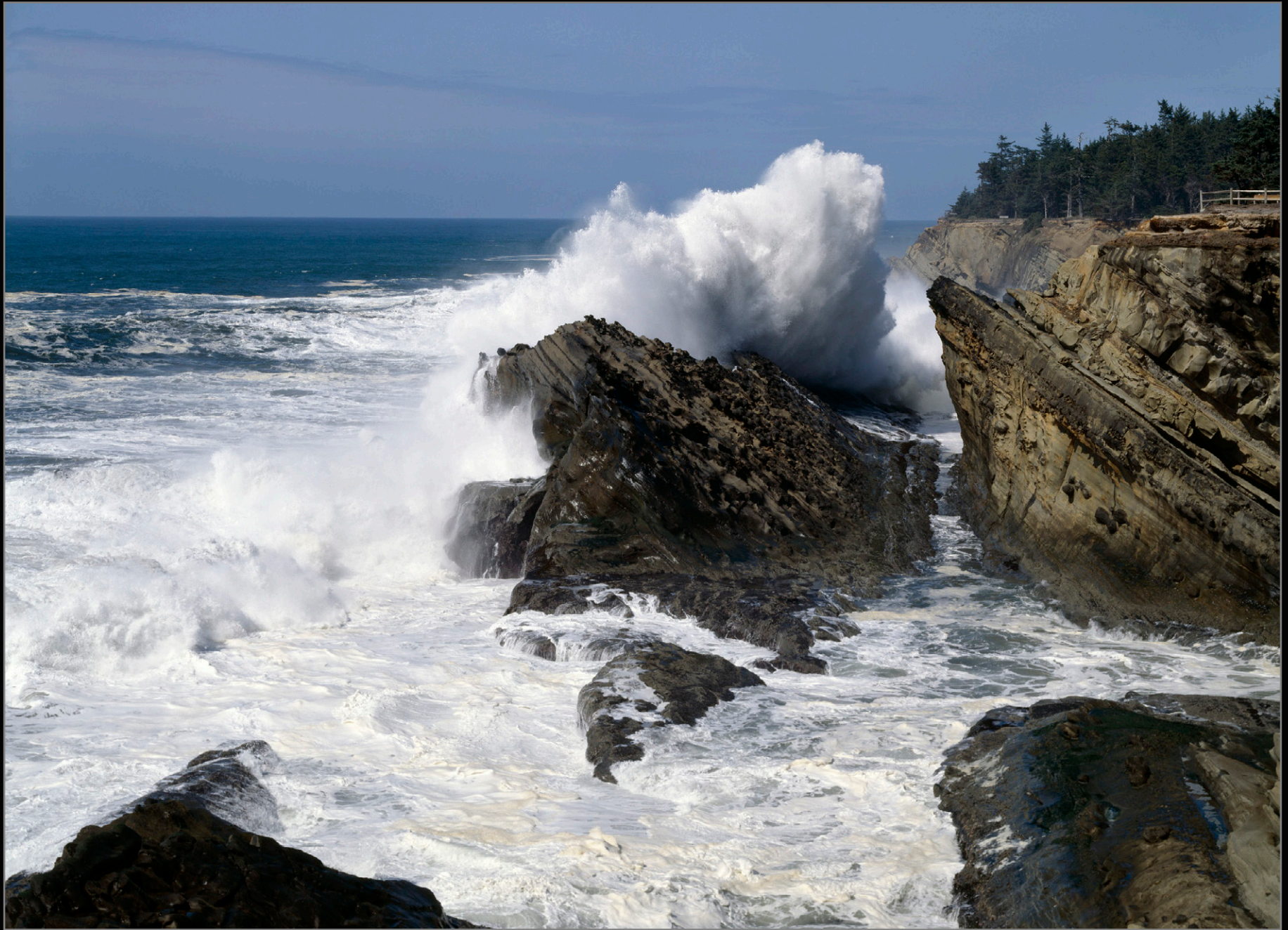
Shore Acres 5