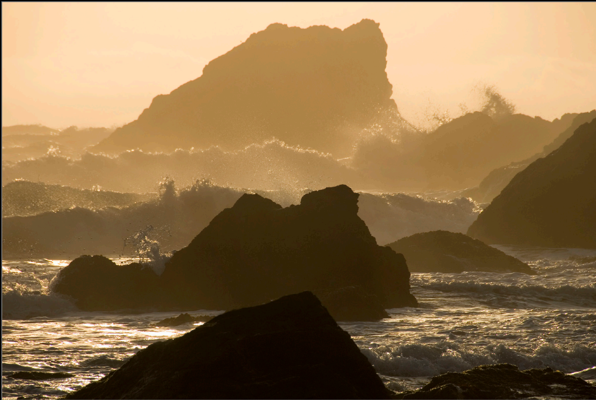
Harris Beach 3 Stacks & Surf