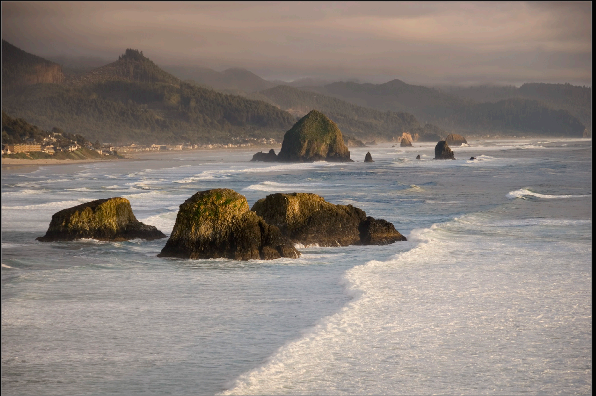
Ecola SP Cannon Beach & Haystack Rock