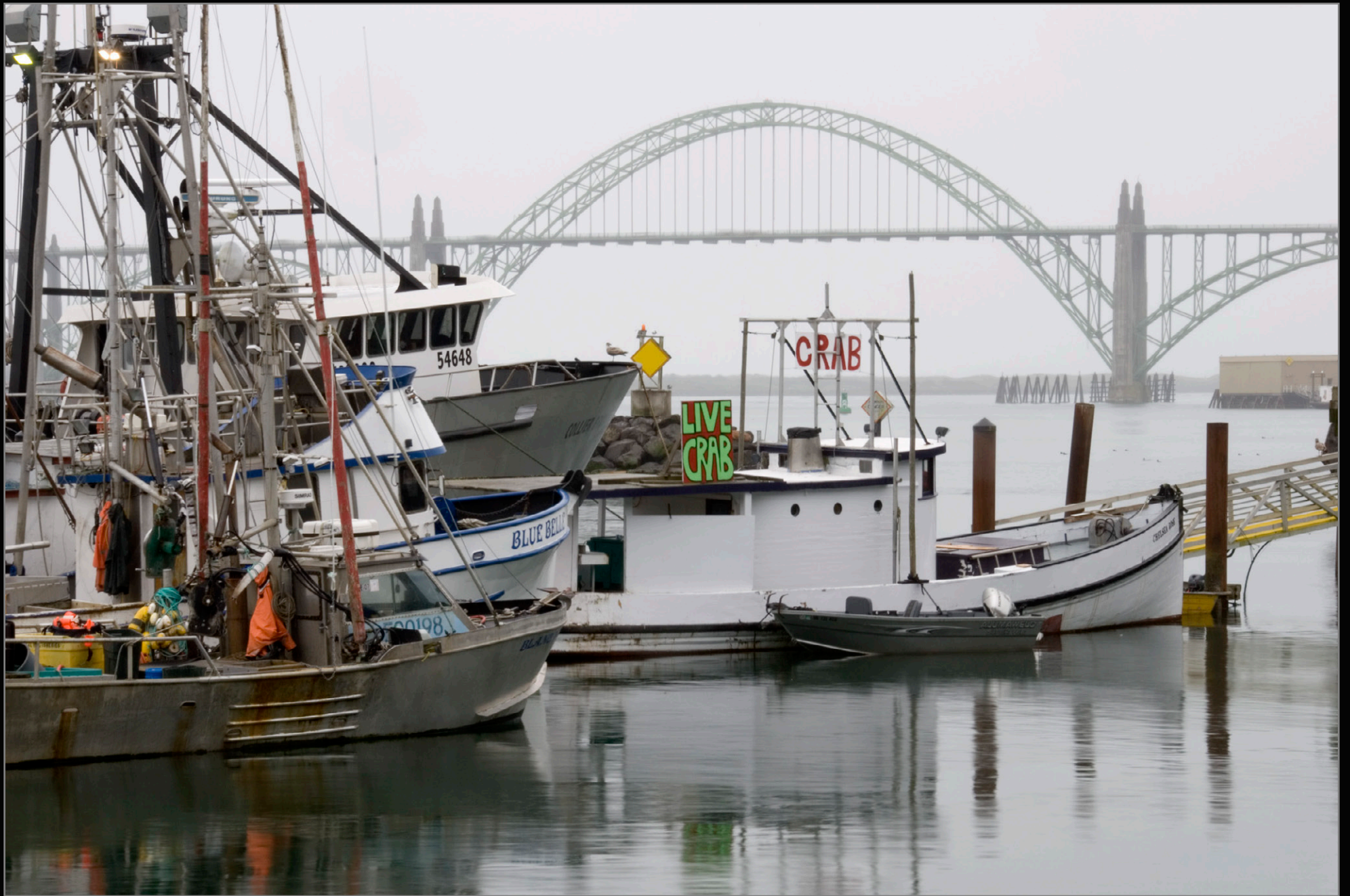
Newport Harbor & Bridge